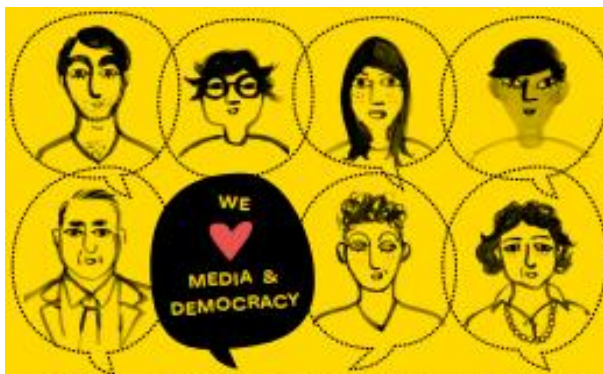
The Austrian Citizens' Parliament on Media and Democracy