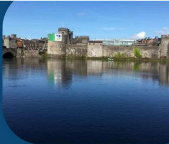
Image: King John's Castle, Limerick City, Ireland